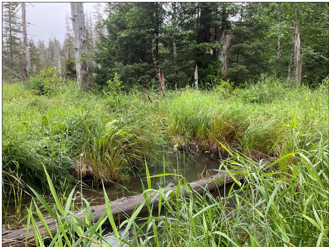
Figure 3.—Channel at waypoint 1239.