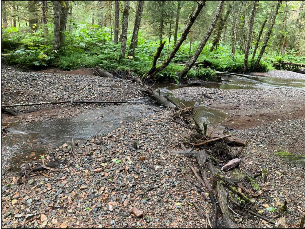
Figure 2.—Confluence with Stream No. 11-12-10160 at waypoint 1240.