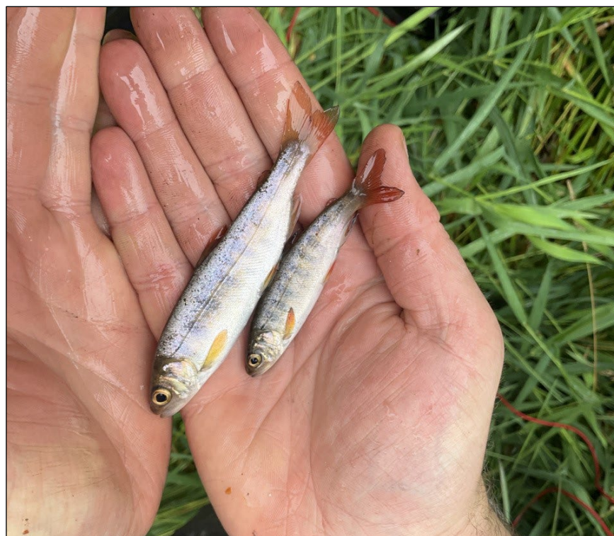
Figure 1.—Juvenile coho salmon captured at waypoint 1239.